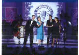
ALL HANDS ON DECK CHRISTMAS SHOW