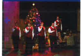
THE HUGHES CHRISTMAS SHOW