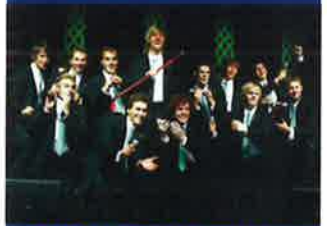
DUBLIN IRISH TENORS & THE CELTIC LADIES CHRISTMAS SHOW

Departure: Union State Bank, 611 W. Highway 92, Winterset, IA @ 8 am