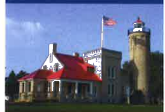
Mackinac Point Lighthouse