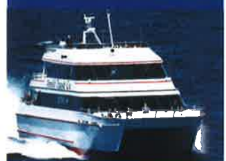
Mackinac Island Ferry

Departure: Union State Bank, 611 W. Hwy 92, Winterset, IA @ 8 am